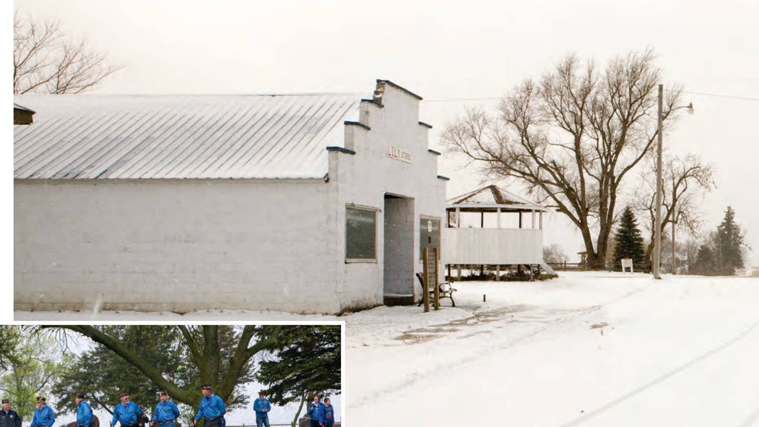
American Legion Post #156 provides the honor guard during an annual Memorial Day service at the Lily cemetery.

ILY'S POPULATION is somewhat of a mystery. There were never that many houses — early families were large. Today nine houses within the city limits are habitable while four stand abandoned. Some are second homes or rentals, but after an exhaustive investigation we're fairly certain three permanent residents live in the tiny hamlet south of Webster. (We found someone who knew them, but she was tight-lipped with names.) More people filter through, drawn by hunting, fishing and even photography.